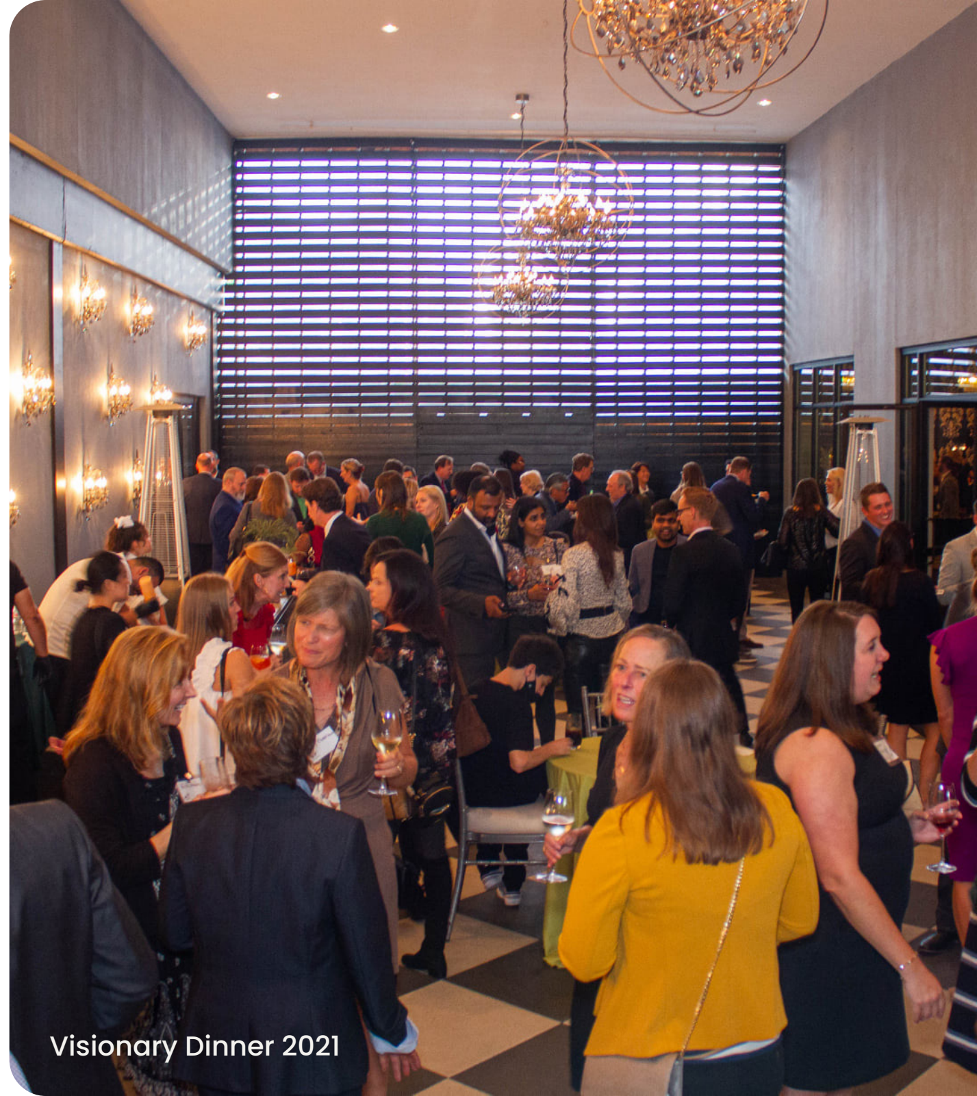
Visionary Dinner 2021

The Infrastructure Investment and Jobs Act passed, and we began working to turn federal resources into active state and local projects.