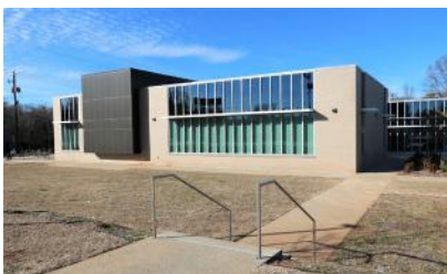
Metropolitan Branch Library

Four candidate sites have initially been selected from the County's portfolio of community-serving facilities, based on a high-level analysis of community data and solar-plus-storage feasibility. Community engagement and educational programming will take place at all four sites, with one being selected to eventually become a community resilience hub.