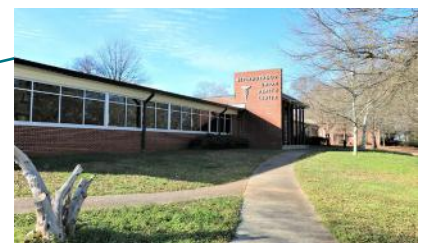
Neighborhood Union Health Center