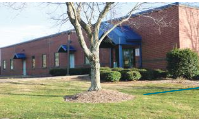
College Park Regional Health Center