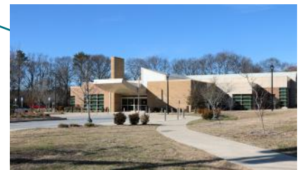
Louise Watley Library at Southeast

Contact the project leads below for more information: