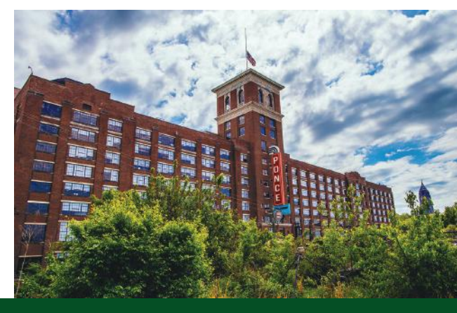
The Flats at Ponce City Market, LEED Multifamily Mid-Rise - Gold