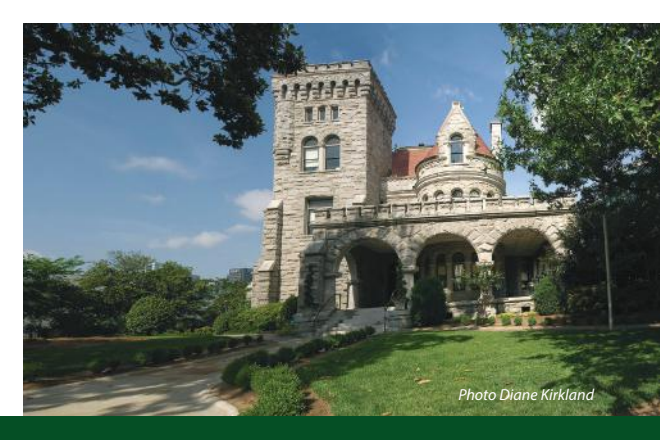
Rhodes Hall, EarthCraft Sustainable Preservation