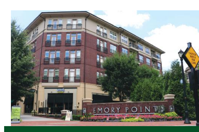
Emory Point, EarthCraft Multifamily Certified