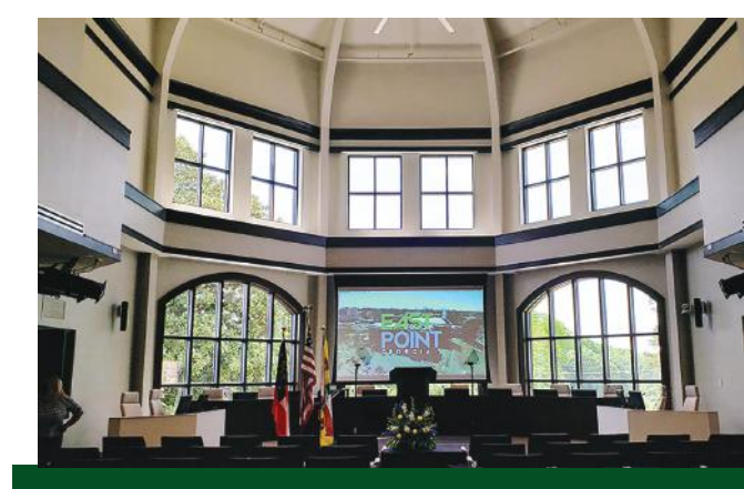
East Point City Hall, EarthCraft Light Commercial - Platinum