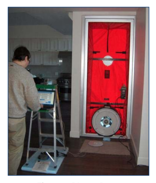
Figure 1. Blower Door.

Whole House Air Leakage: A blower door test system uses a calibrated fan to measure air infiltration levels for the whole house. The blower door is mounted at an exterior door and the fan pulls air out of the house at a specific pressure. Outside air then flows into the house through all unsealed cracks and openings. The calibrated air flow through the fan is a measure of the amount of total air leakage from the home. A record of this measurement can then be compared with tests following air sealing upgrades. For measuring existing infiltration rates, the home should be depressurized to 50 Pascals per the ANSI/ASTM E-779 standard, as well as equipment manufacturers' and energy program guidelines.