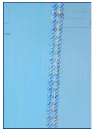
4) If foam sheathing will function as WRB, tape seams according to manufacturer's instructions.