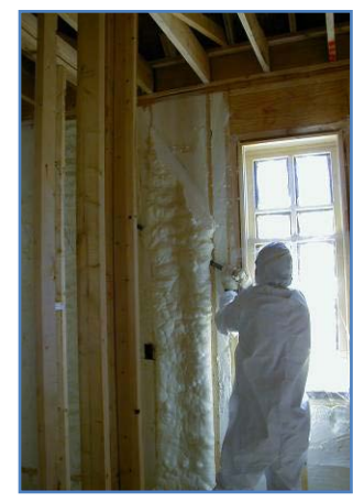
3) Remove excess foam if necessary