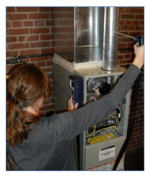
Figure 4. Draft Pressure Testing using Combustion Analyzer.

<u>Combustion Equipment Venting</u>: To determine if backdrafting of vented combustion appliances is possible, a Combustion Appliance Zone (CAZ) Worst Case Depressurization test should be conducted following the BPI Home Energy Auditing Standard. The CAZ testing indicates whether the potential exists for combustion equipment to leak combustion gases into the home.