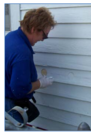
5) Following the insulation, retrofit access holes are sealed using tapered wooden plugs. For exterior applications siding is reinstalled. Interior plugs should be spackled and prepped for paint finish.