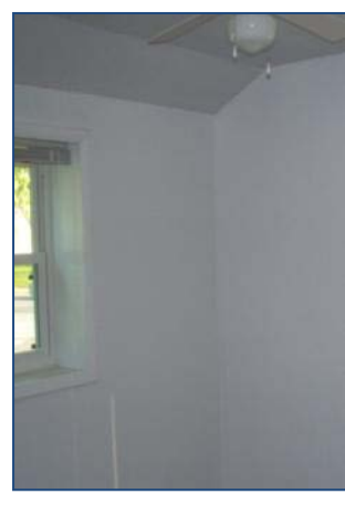
5) Finish interior walls.