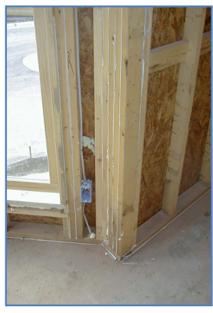
1) Complete all air sealing and rough-in work prior to installing insulation and mask junction boxes