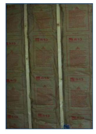
4) Insulate 2x4 wall.