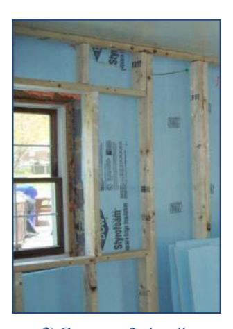
3) Construct 2x4 wall.