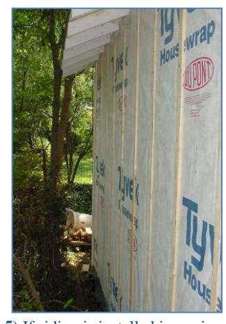
5) If siding is installed in a rain screen configuration install furring strips attached directly to the underlying framing.