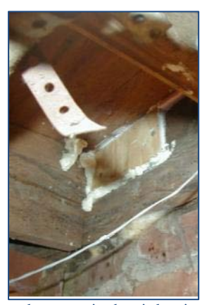
1) Sealing large bypasses in the air barrier may require the use of sheet goods, such as plywood or extruded foam sheathing. These rigid barriers should be attached with mechanical fasteners and sealed with caulk or expanding foam.

See Appendices: Air Sealing Key Points and Air Barrier and Insulation Inspection for more information.