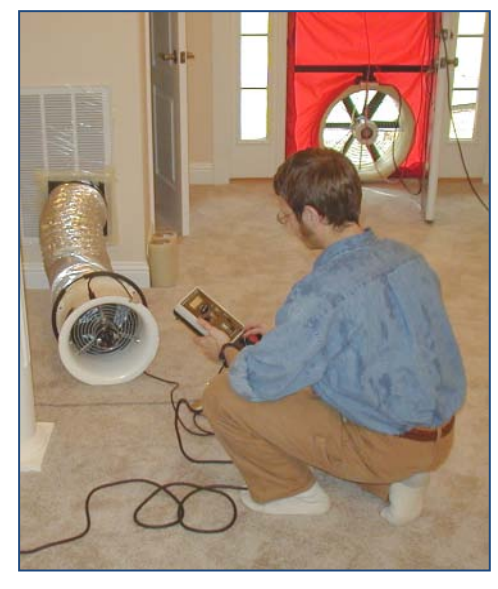
Figure 2. Duct Blaster.

HVAC Duct Air Leakage: Leaky, uninsulated (or minimally insulated) ducts in attics or crawlspaces can account for a large amount of a home's heating and cooling energy losses. Similar to a blower door, a duct blaster (duct pressurization test) uses a calibrated fan to test the leakage rate in air ducts. To measure leakage rates, ducts are typically pressurized to 25 Pa following equipment manufacturers' and energy program guidelines. Duct leakage can be expressed in multiple ways including the fan flow (CFM) at 25 Pascals (CFM25) per square foot of conditioned area served, CFM25 per 100 square feet, and/or percent of system design flow.