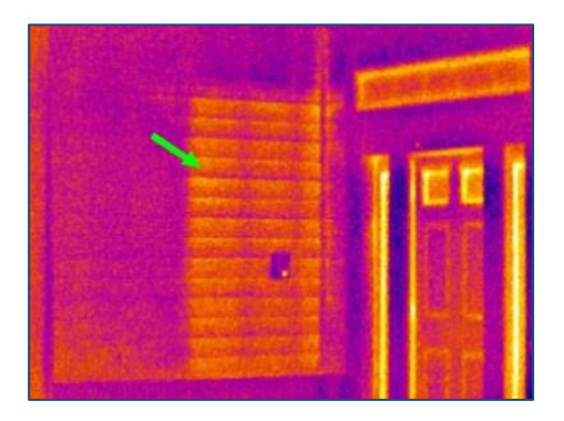
Figure 3. Infrared Image.

<u>Thermography Scans</u>: Insulation and Air Sealing Integrity: Thermography, using an infrared camera, can be used to assess framed wall cavities and for the presence and completeness of insulation. In addition to identifying missing or insufficient insulation, an infrared camera can also be used in conjunction with a blower door to locate infiltration pathways. This infiltration test should always be conducted after completing cavity insulation inspections per the guidance from the ASTM E 1186 Standard.