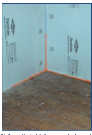
2) Install rigid foam and air seal.