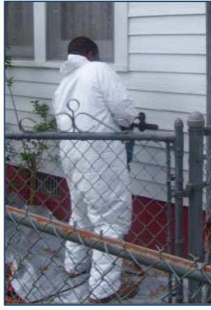
1) Access holes are drilled for each cavity, in this case through the siding and exterior sheathing