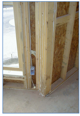
1) Complete all air sealing and rough-in work prior to insulation installation and mask junction boxes.

considered with respect to the recent editions of the International Residential Code and local requirements.