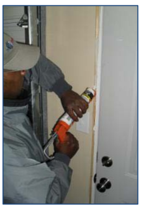
2) Seams between building materials and small holes or cracks can be sealed using expanding foam or caulk. Backer rod can be used for seams larger than 5/16" to support the air sealing product.