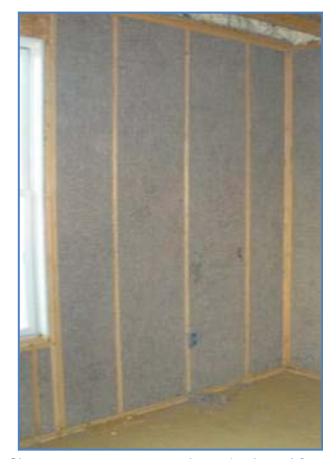
3 ) Remove excess insulation if necessary.