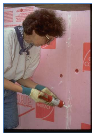
2) Secure insulation using plastic cap nails.