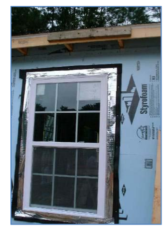
3 ) Caulk and seal at penetrations, and at window and door jambs.