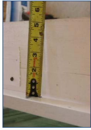
1) Extend door and window jambs as necessary.