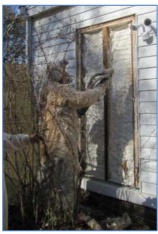
2) Apply foam to desired thickness following manufacturer's instructions