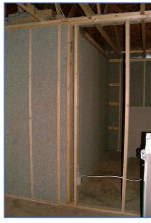
2) Apply insulation to fill entire cavity, according to manufacturer's instructions.