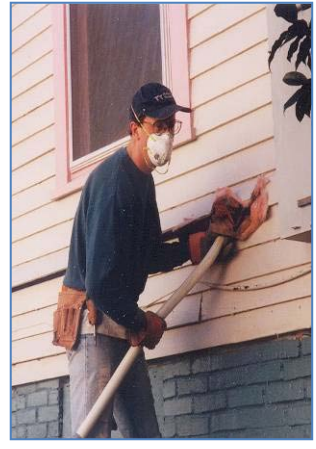
4) Insulation installation should begin with full-height walls without obstructions to accurately gauge insulation density. Best practice is to fill the top of the cavity completely and then to reinsert the tube to fill the bottom of the cavity. The fill tube is slowly removed as the cavity fills.